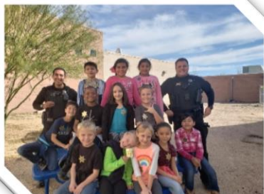
Our Kids of Character winners enjoyed a lunch celebration with our own Wickenburg police officers.

This is a busy time of year, but also a great time to spend quality time with your child.